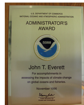
NOAA: For ... assessing the impacts of climate change on global oceans and fisheries